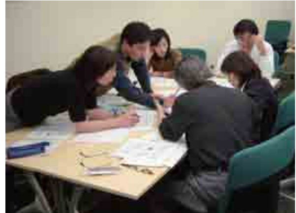
Figure4: Education courses for Nursing Managers (left), and for Managers (right)