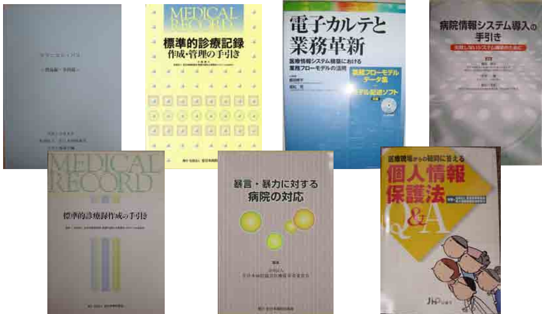
Figure6: Recent Publications

On medical care and long-term care in Japan -A message from the AJHA Committee on the Future of Hospitals to the Japanese people, 2008