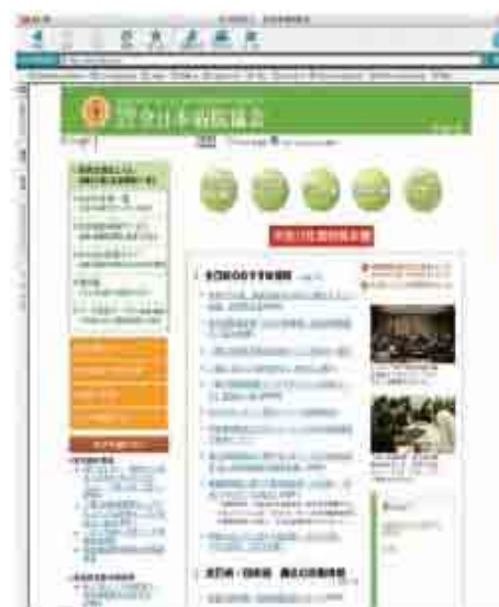
Figure5: AJHA News (left), and AJHA homepage (right)