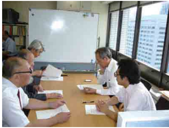
Figure3: Policy planning and proposal at Ministry of Health, Labor and Welfare

are included in these surveys. The results are available to the public on the AJHA website and are used in the discussion with the Chu-I-Kyo (National Committee on Revision of Reimbursement Tariff).